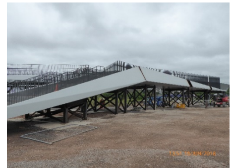
St Philips Bridge 2018 (still under construction)