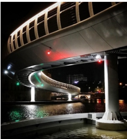
Castle Bridge 2017